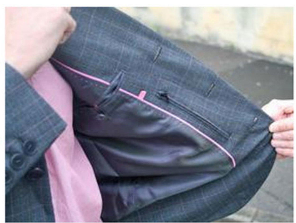
Inside, the jacket has two in-breast pockets and an additional zipped valuables pocket

You can follow BikeRadar on Twitter at twitter.com/bikeradar and on Facebook at facebook.com/BikeRadar .